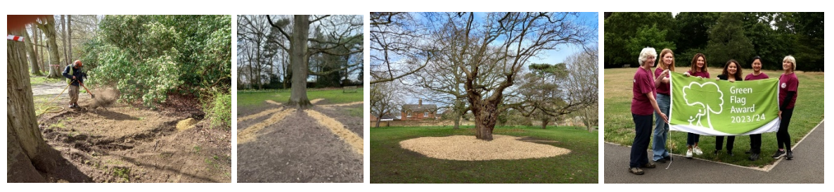
IMAGES: ATS Specialist Contractors Air Spading Tree Root Zones and Topping up with Perlite and Green Flag flying in Cannizaro

2.6. Please note Appendix 2 attached below which outlines the Phase 1 Tree Strategy progress made by the council between October- December 2023