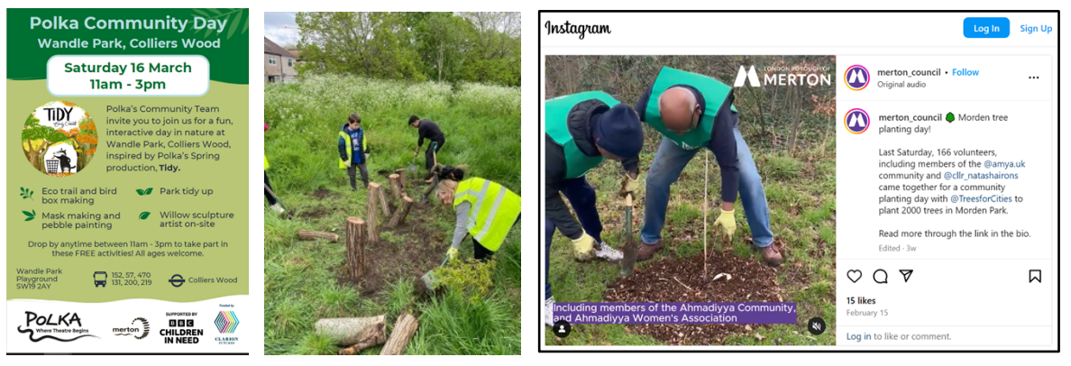
IMAGES: Polka Theatre Tidy Event / Wandle Habitat Creation / Trees for Cities Morden Park

The council have worked with Polka Theatre linked to its theatre production TIDY and will be delivering a litter pick and habitat creation project at Wandle Nature Park on the 16<sup>th</sup> March 2024.